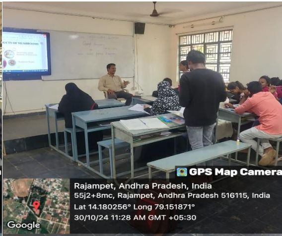
Rajampet, Andhra Pradesh, India 55j2+8mc, Rajampet, Andhra Pradesh 516115, India Lat 14.180256° Long 79.151871° 30/10/24 11:28 AM GMT +05:30