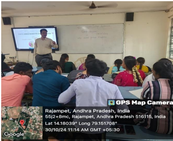
Rajampet, Andhra Pradesh, India 55j2+8mc, Rajampet, Andhra Pradesh 516115, India Lat 14.18039° Long 79.151708° 30/10/24 11:14 AM GMT +05:30